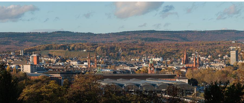
Panorama of Wiesbaden with the Hauptbahnhof

Cross the main road and you should be back at the train station where you started your Wiesbaden adventure!