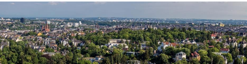
Panorama of Wiesbaden from the Löwenterrasse

After leaving the church, follow the trail to the west about 50m and then go left and head south about 120m. Make a right onto Neroburgstraße and follow it south for about 400m until you get back to the Nerotal Park. Now hang a left and go about 900m back to the Kochbrunnen and join back up with the main trail on page 11!