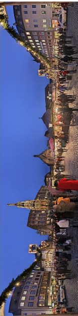
The famous Nuremberg Christkindlesmarkt (Christmas market) in the Hauptmarkt during Nov-Dec each year!