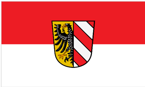
Flag of Nuremberg

When the ancient German Empire fell in 1803, Nuremberg became a part of the Kingdom of Bavaria. The resulting change was for the better in every respect. The city trade, industry, and crafts saw an unforeseen boom, and this development was reflected in the growth of the city. Although Nuremberg was one of the most populous towns of the Middle Ages, its population numbered only about 20,000 in 1450. In 1620, the city boasted over 40,000 inhabitants. However, during the thirty-year War the numbers sank down to 25,000. Even up to 1806, the year Nuremberg became a part of the Kingdom of Bavaria; the population was still only 26,000. However, with the unexpected economic boom came rapid population growth, and by 1840 there were 47,000; by 1860 more than 60,000; and by 1890 over 143,000 souls inhabiting the city. In 1939, there were about 425,000 inhabitants, but at the end of the War, the population sank down to 175,000. Today, after rapid rises in commerce, the city boasts a population of over 500,000.