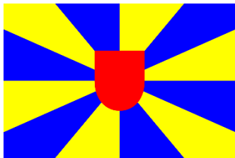
Flag of West Flanders

You have now completed the optional cycle route and can either ride back to Ypres or your hotel/campsite!