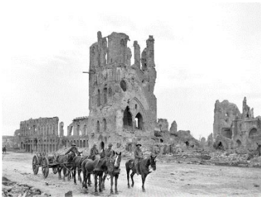
Ruins of the Cloth Hall during WWI

The Flanders Field Bike Route is about 32km with an optional 19km detour to visit several additional sites. Experienced bikers may finish this route in several hours but for most of us, this is an all day adventure. Just remember, the goal is the trail, not the finish.